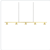
LP19947-BB Brushed Brass