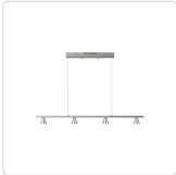
LP19937-BN Brushed Nickel