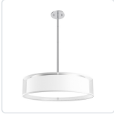
PD7920-WOR White Organza