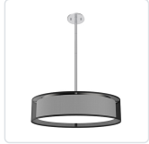
PD7920-BOR Black Organza