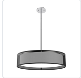
PD7916-BOR Black Organza