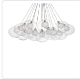
CH3128-CL Clear Glass