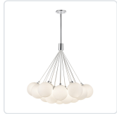
CH3128-OP Opal Glass