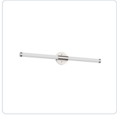
VL18532-BN Brushed Nickel