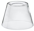
F6284000 Ktribe Table 1 transparent diffuser assembly