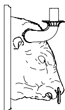
AP251 BC INT