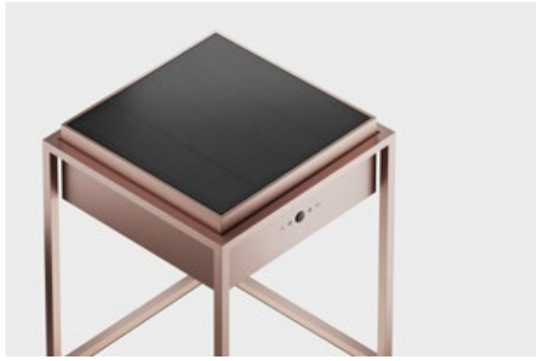
Auto mode, automatically turns on at dusk and turns off 5 hours later