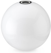
F3137030A IC Lights 2 diffuser for black version