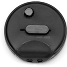
RF28209 4W -25W Black Led Dimmer