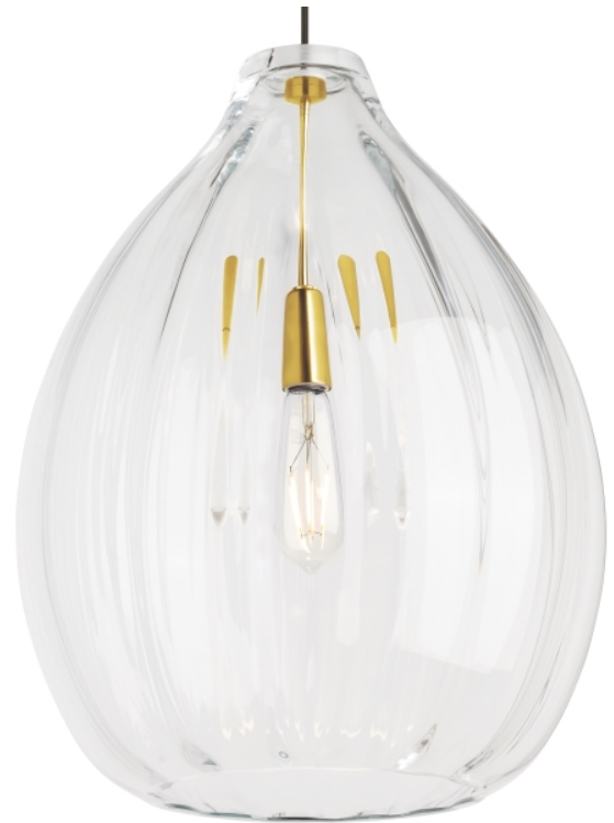
Clear/Natural Brass Incandescent