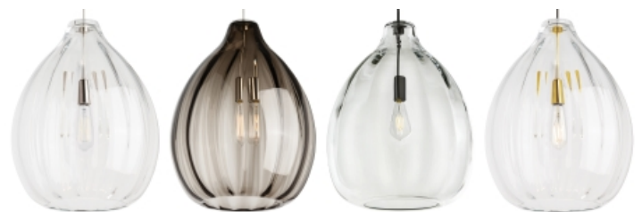
Clear/Satin Nickel Incandescent

Rated for (1) 60 watt max, E26 medium base lamp (Lamp Not Included). LED includes (1) 120 volt 3.5 watt, 263 delivered lumen, 2700K, medium base LED vintage squirrel cage lamp. Dimmable with most LED compatible ELV and TRIAC dimmers. Black ships with six feet of field-cuttable black cloth cord. Satin Nickel ships with six feet of field-cuttable cable.