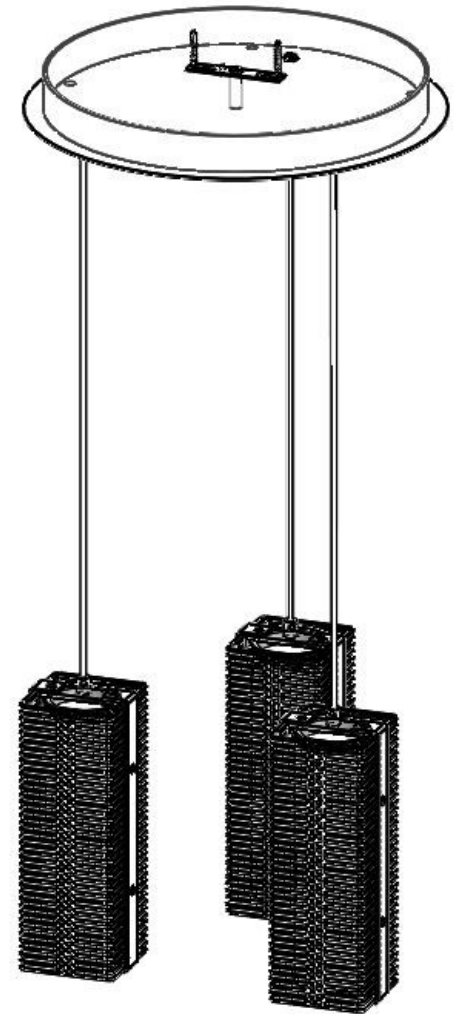
Example Fixture: CHB0020-03

Step 5: If purchased without the glass option, then install the appropriate bulbs and disregard step 4.