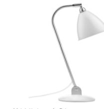
// White / Chrome