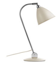
// Off-White / Chrome