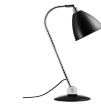
// Black / Chrome