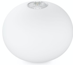
F3015061 Glo-Ball 2 white diffuser