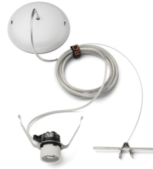
AU251200 GloBall S2 Halogen Electrical Wiring Assembly