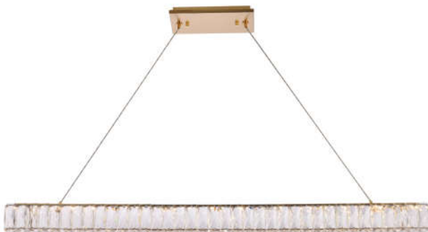
Satin Gold Item No:3502D47G