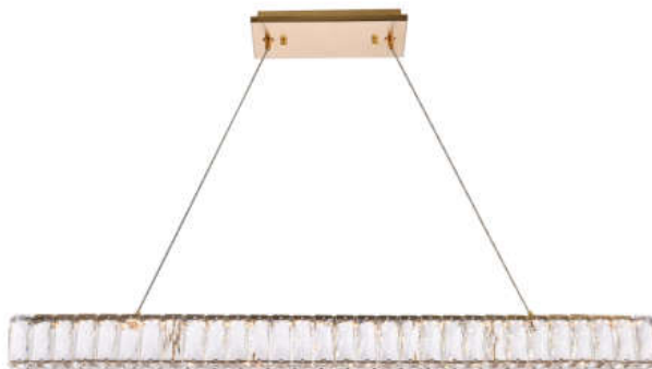
Satin Gold Item No:3502D38G