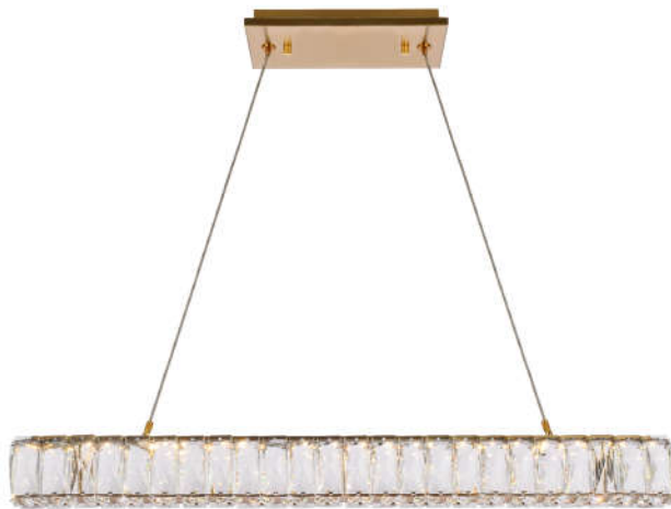
Satin Gold Item No:3502D31G