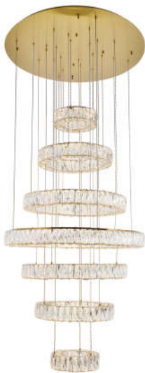
Gold Item No:3503G34G