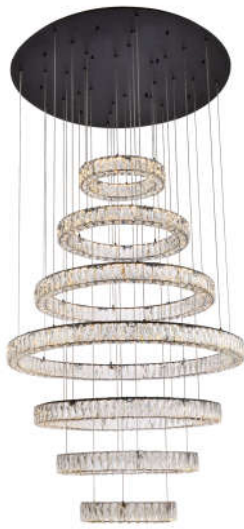
Black Item No:3503G34BK