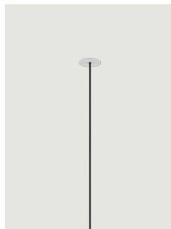
Recessed Micro - Low Voltage