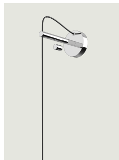
Wall Standard - Line Voltage