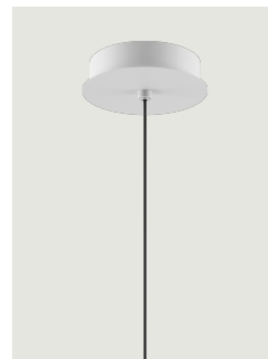
Single - Low Voltage