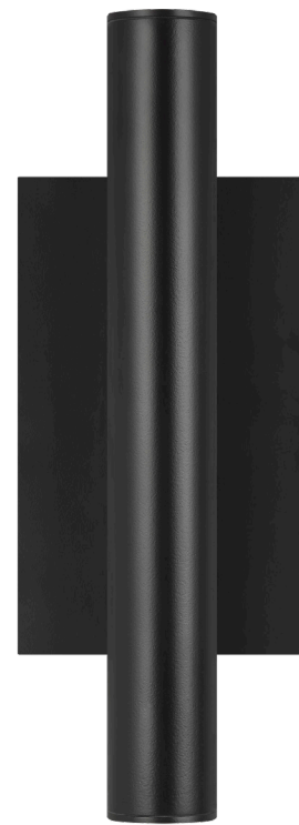
CHARA 12 OUTDOOR WALL shown in black