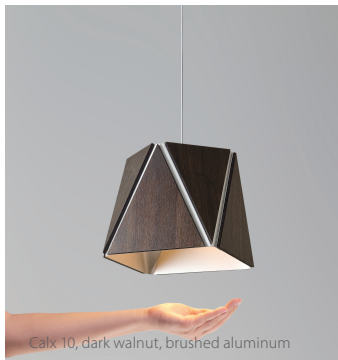
Calx 10, dark walnut, brushed aluminum