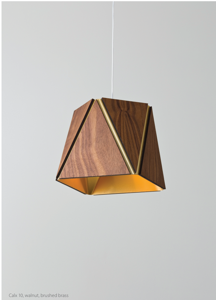
Calx 10, walnut, brushed brass