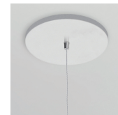
low-profile round canopy with braided cord