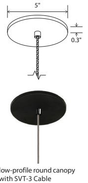
low-profile round canopy with SVT-3 Cable

*Available in 3000K, 4000K and other color temperatures upon request