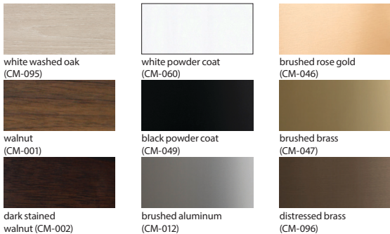
white washed oak (CM-095)