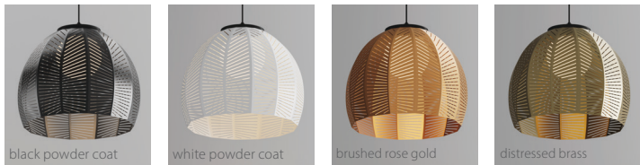
black powder coat