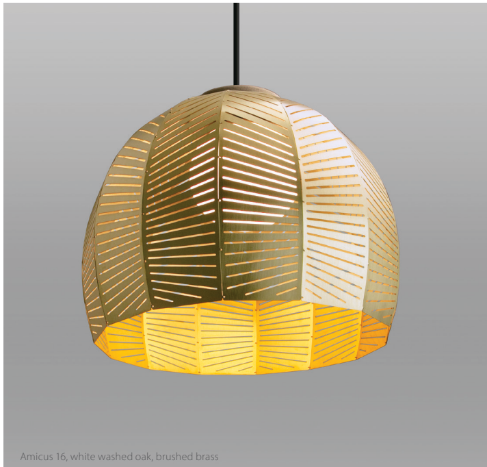
Amicus 16, white washed oak, brushed brass