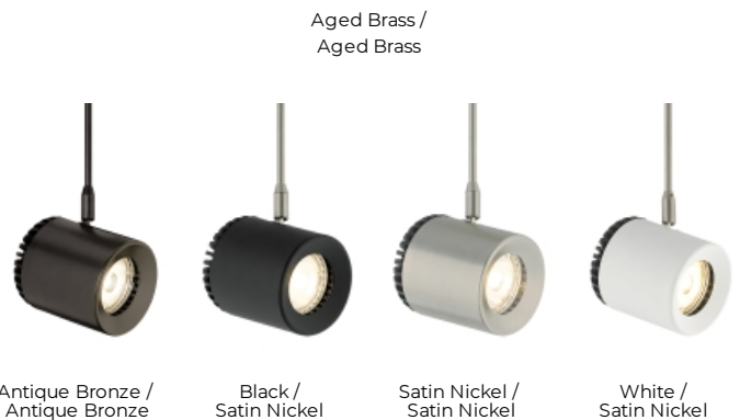
To view all available finish options, please visit techlighting.com

Includes field replaceable 12 watt, 737.1 delivered lumen, 2700K, 3000K or 3500K field replaceable LED module. Dimmable with most LED compatible ELV or Triac dimmers. Choice of 18° or 40° field changeable optics. Integrated lens holder accommodates up to two MR16 sized lenses or louvers (sold separately). As a general rule when using the Burk head, we do not recommend using greater than 33% of the maximum wattage specified for the low voltage transformer due to inrush current requirements. For assistance in calculations, please contact Technical Support.