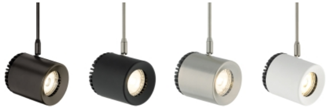
Antique Bronze / Antique Bronze