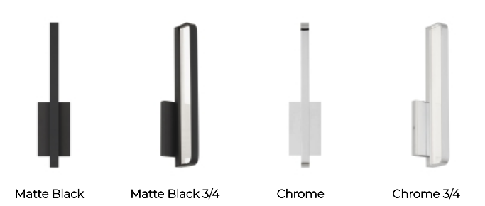
To view all available finish options, please visit techlighting.com