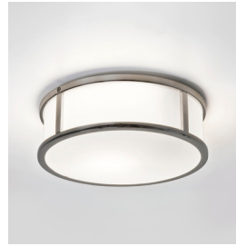
CODE: 1121029 FINISH: POLISHED CHROME