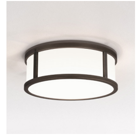
CODE: 1121095 FINISH: BRONZE

TO MAINTAIN THIS PRODUCT TO ITS BEST CONDITION, PLEASE VIEW OUR CARE AND CLEANING GUIDELINES ON THE SUPPORT SECTION OF THE ASTRO WEBSITE.