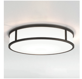
CODE: 1121092 FINISH: BRONZE

TO MAINTAIN THIS PRODUCT TO ITS BEST CONDITION, PLEASE VIEW OUR CARE AND CLEANING GUIDELINES ON THE SUPPORT SECTION OF THE ASTRO WEBSITE.