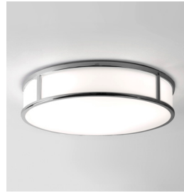
CODE: 1121031 FINISH: POLISHED CHROME