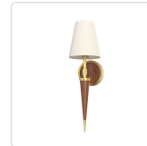
WV351101VBWT Vintage Brass/Walnut

*For complete warranty terms, please visit: www.aloralighting.com/warranty