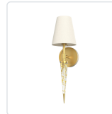
WV351101VBFG Gold Flake/Vintage Brass