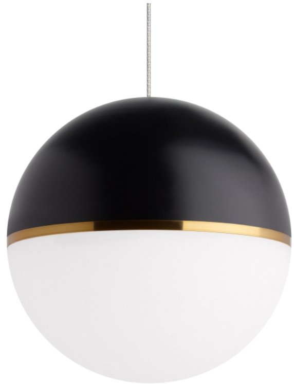
Matte Black Aged Brass