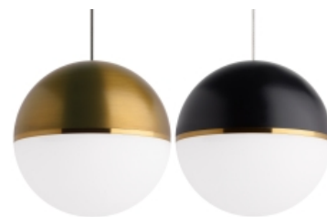
Aged Brass Bright Brass