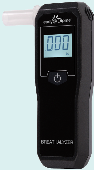
Fuel Cell Breathalyzer