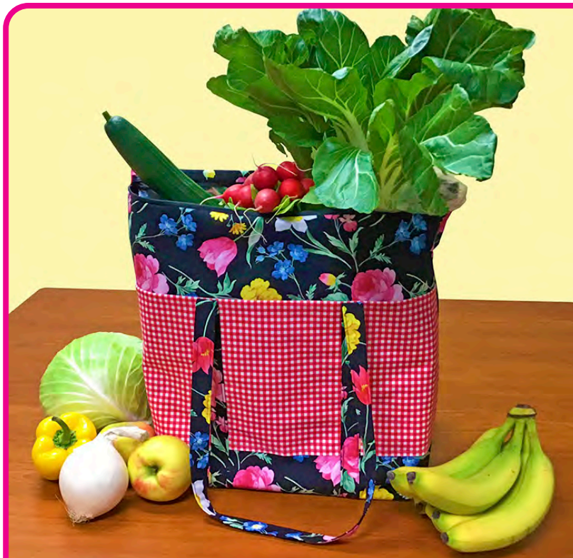
Cooler Grocery Tote & Insulated Lunch Tote Pattern by Nancy Zieman Productions. https://nz-productions-llc.myshopify.com/