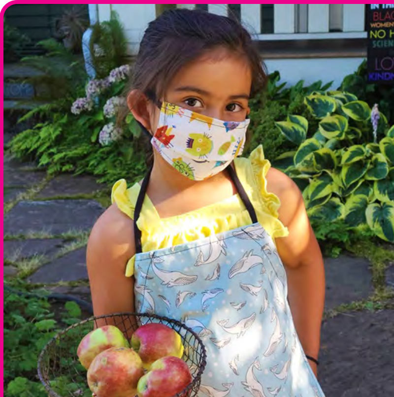
Splash Fabric laminated cotton mask & apron. https://splashfabric.com/