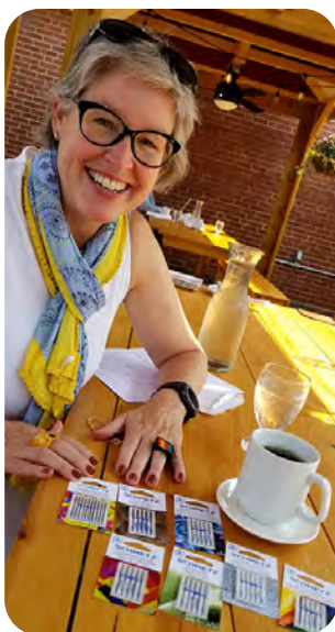
Rhonda casually reveals the new SCHMETZ combo packs.

What needle should I use? When sewing, quilting or crafting, it's a question many of us ask. I always like to say, with SCHMETZ you have options.