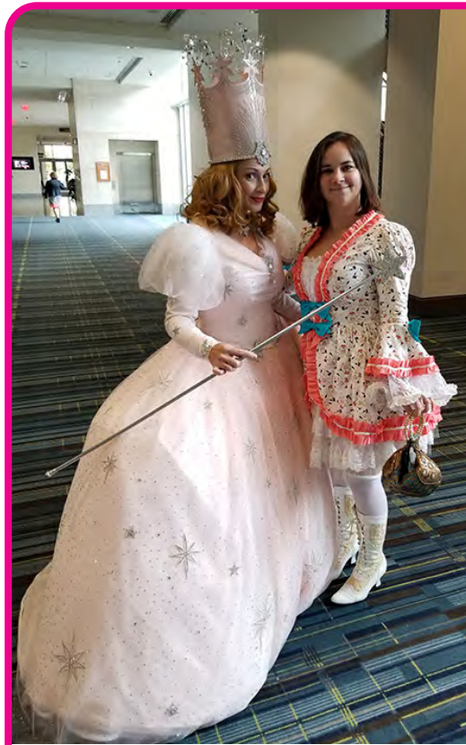
2019 Original Sewing & Quilt Expo, Raleigh NC https://sewingexpo.com/