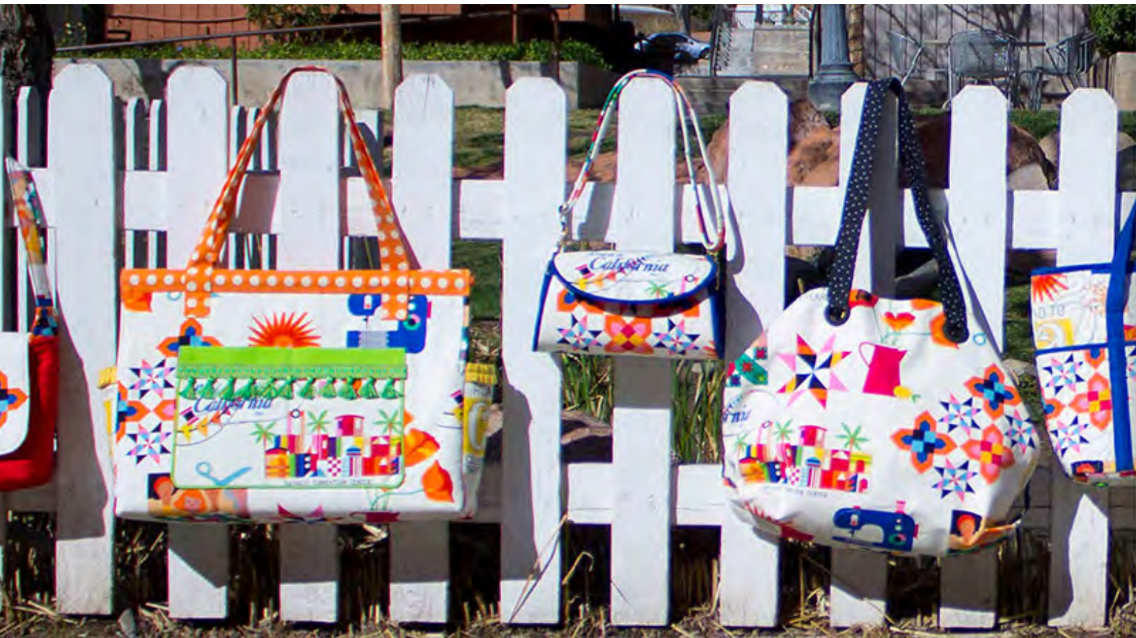
2016 Road to California Bag Ch

I had always enjoyed writing and working on the computer. We had an inn in Alaska and I worked with a graphic designer to design brochures and advertising material, so had a general idea of desktop publishing.