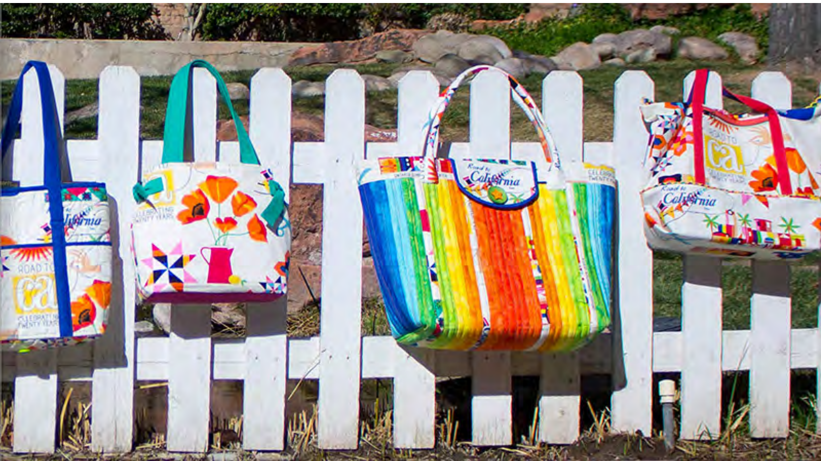
challenge sponsored ByAnnie.com.