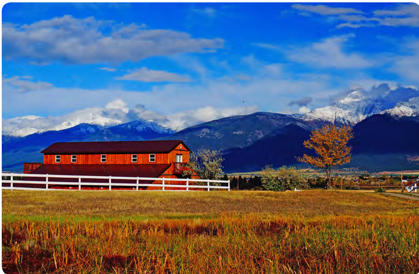
Montana calls from the Rugged Horizon.