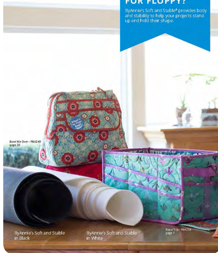
ByAnnie.com 2016 Catalog

ByAnnie's Soft and Stable® provides body and stability to help your projects stand up and hold their shape.