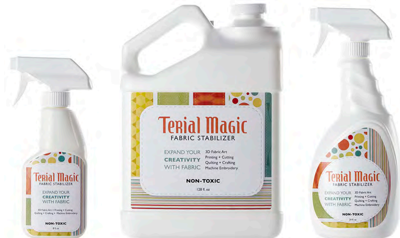
Terial Magic Fabric Stabilizer