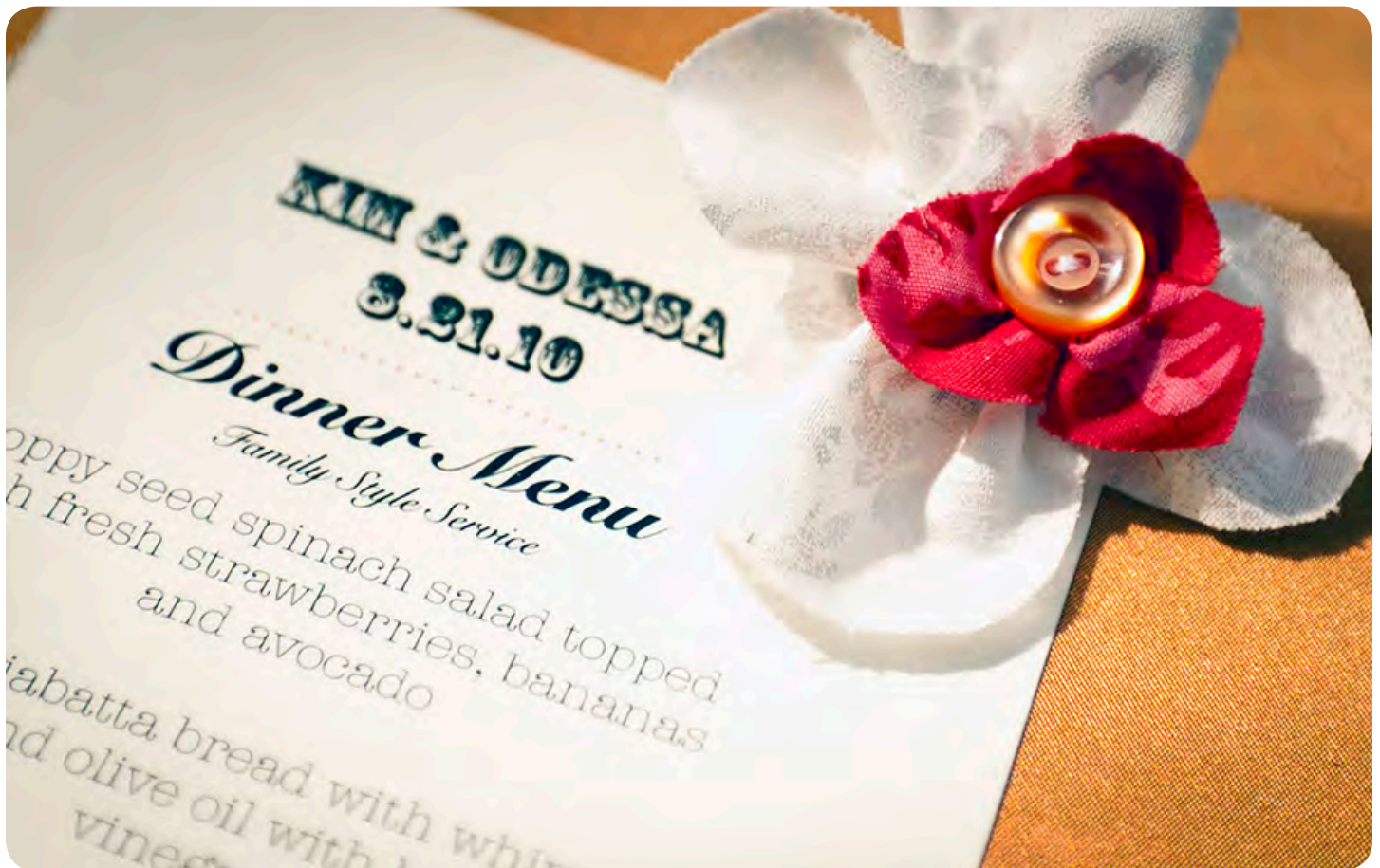
The fabric orchid that launched Terial Magic.

In 2010 my daughter was getting married and wanted fabric flowers in her wedding décor. One of the many fabric flower projects that I designed (and made) was fabric orchid napkin pins. They were beautiful and people raved about them. Many said I should make larger flowers, even DIY patterns. The problem was that these flowers had to be small because of the limpness of fabric and the fraying. I went into the market place to try and find something that might work, I tried stabilizers, fusibles, stiffeners, starch, anything I thought might work, but nothing produced the result I desired.