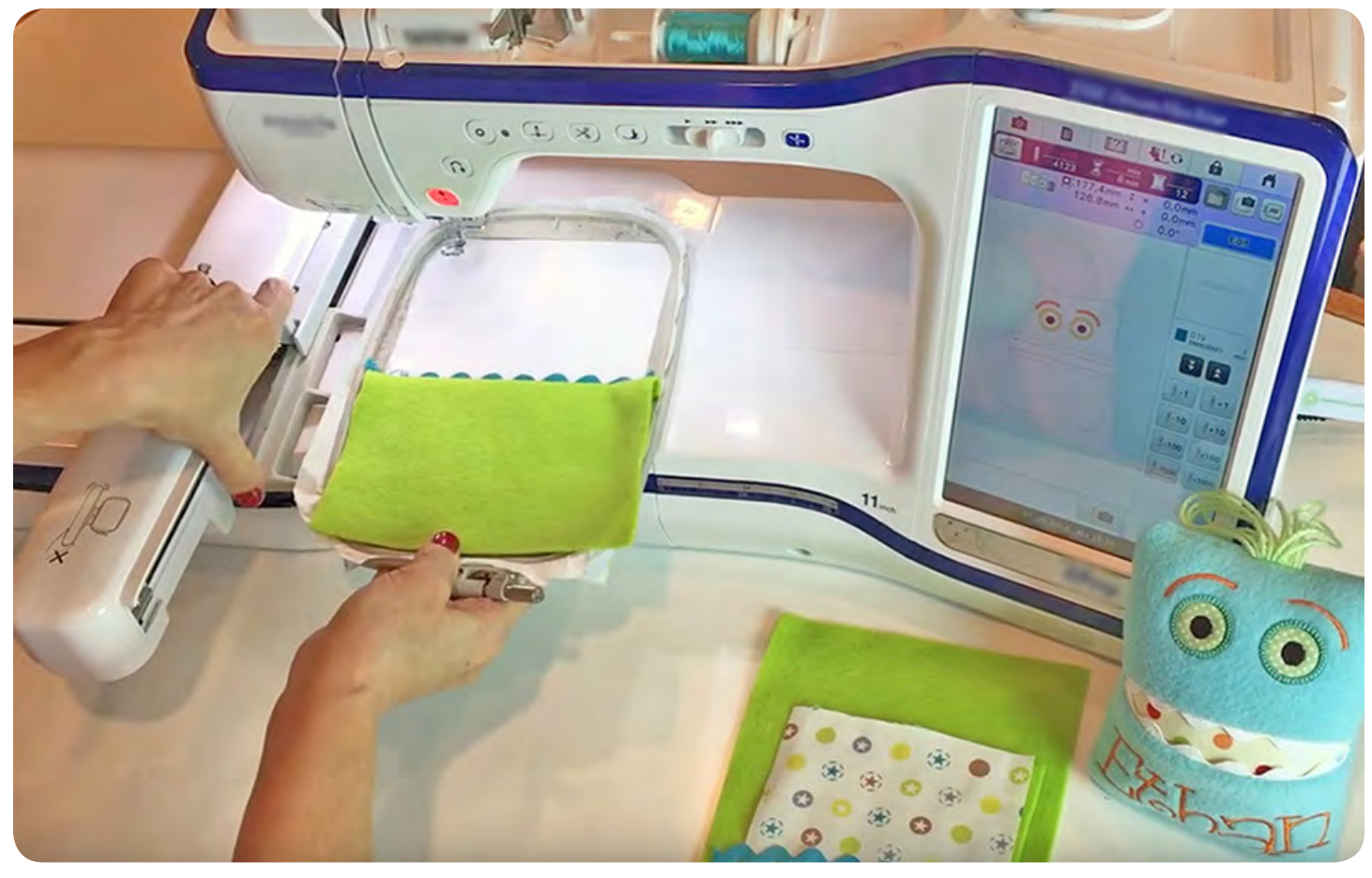
Embroidery "In The Hoop" in action with Embroidery Garden.