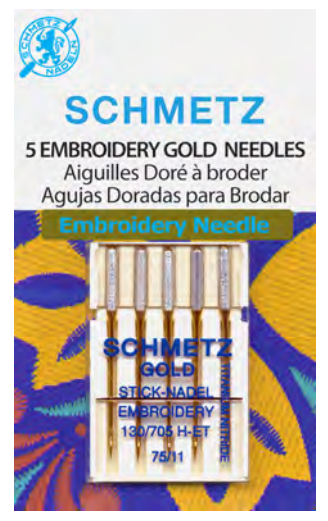
Gold Embroidery, 75/11