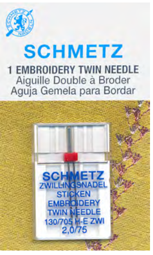
Embroidery Twin 2.0/75