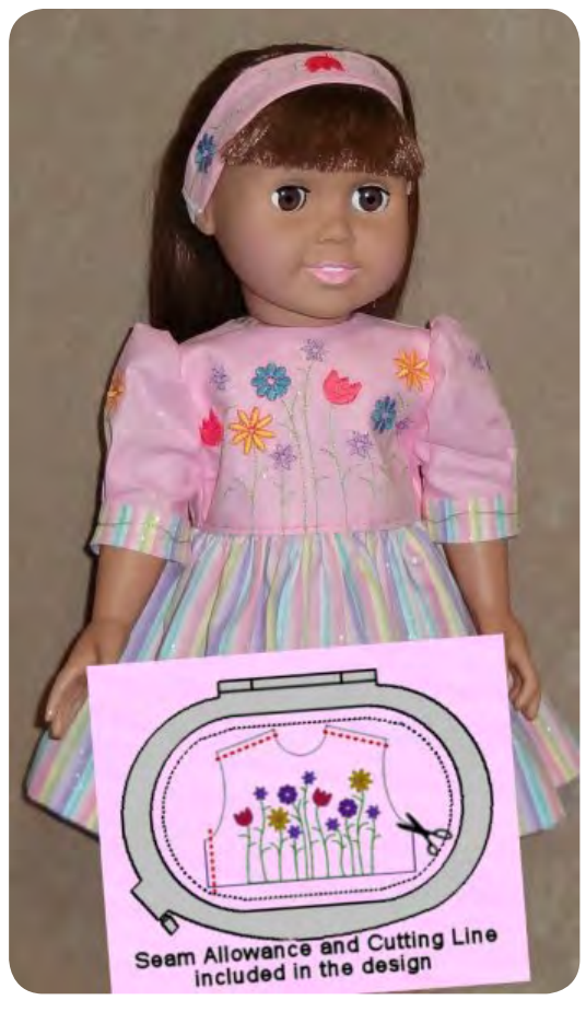
Mastering Machine Embroidery In The Hoop is Easy . . . and Fun! Sisters In Stitches

They started to experiment. What about jeans and all the detailed stitching? CHECK!! They looked great! Perfect topstitching every time — Thank you, embroidery machine. Two fussy steps eliminated.