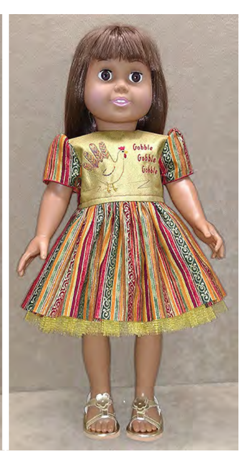
18" Doll Celebration, #D016 Sisters In Stitches

Our most successful events have been 'Grandma and Me' classes. Using their fabric of choice, adding some fun and glitzy threads, Grandma walks her granddaughter through the process of garment construction and there is pure joy on every face. It's a fun class. Sewing machine stores use this class to 'justify' the purchase of an embroidery/sewing machine. Nothing gives a grandma 'permission' to buy the machine quicker than a grandchild looking up at her and saying 'Please grandma, can we make more together?"