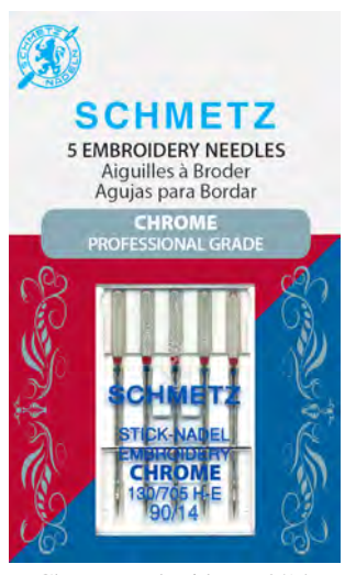
Chrome Embroidery, 90/14

SCHMETZ gives you options! SCHMETZ Embroidery needles are available in two sizes 75/11 & 90/14. Also available are Embroidery Twins in sizes 2.0/70 & 3.0/75. Shadow embroidery anyone?