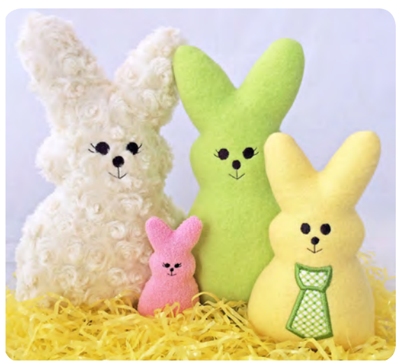
Bunny Softies Embroidery Garden, #MARN124