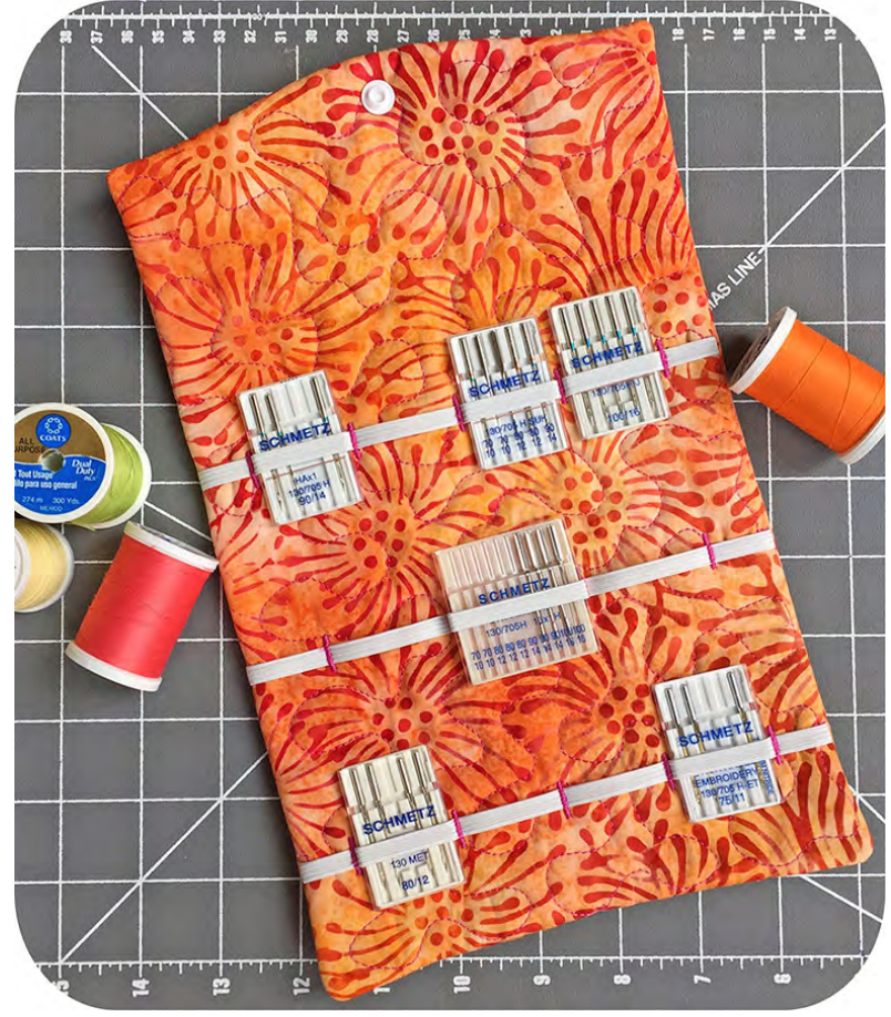
Needle Holder, an Embroidery Garden Design.

"The big advantage to ITH designs is that you produce a consistent product that turns out every time with perfect stitching and placement of your embellishment. Your embroidery machine does all the work for you."