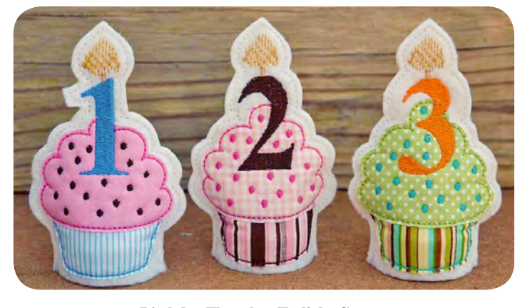
Birthday Flameless Tealight Covers Embroidery Garden, #BIRU143