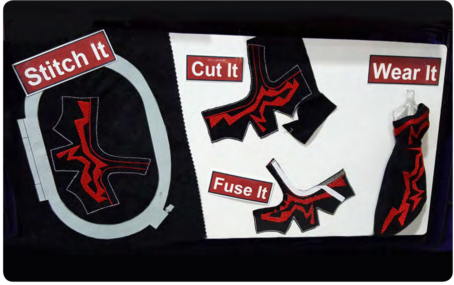
Sisters In Stitches

They decided to create more designs and burn them to CDs. Sisters In Stitches was born. The business name has many meanings. They are sisters by blood and in heart, they sew a lot, and they laugh often (keeping each other in stitches, get it?).