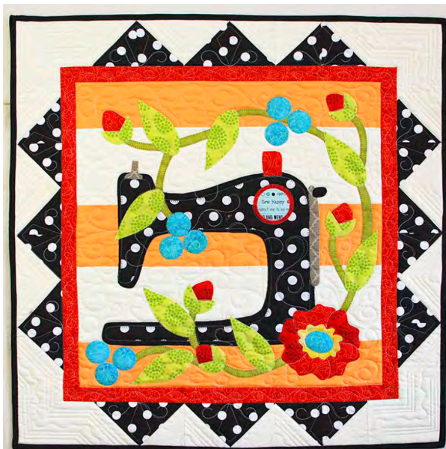
"Let's Go Sew" pattern by Pat.