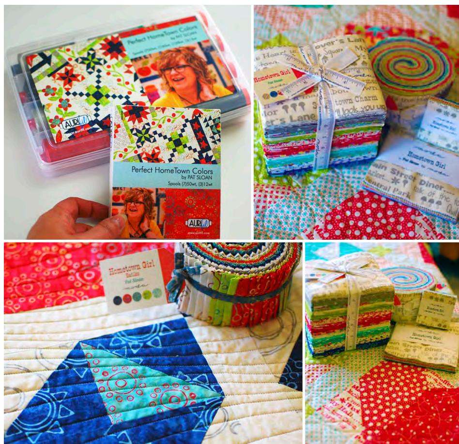
Hometown Girl — Moda and Aurifil.

"My happy place is hanging out with quilters on the internet. And sew alongs, quilt alongs anything alongs are incredible fun. I can't even tell you how many I've hosted or been in the last 17 years!"