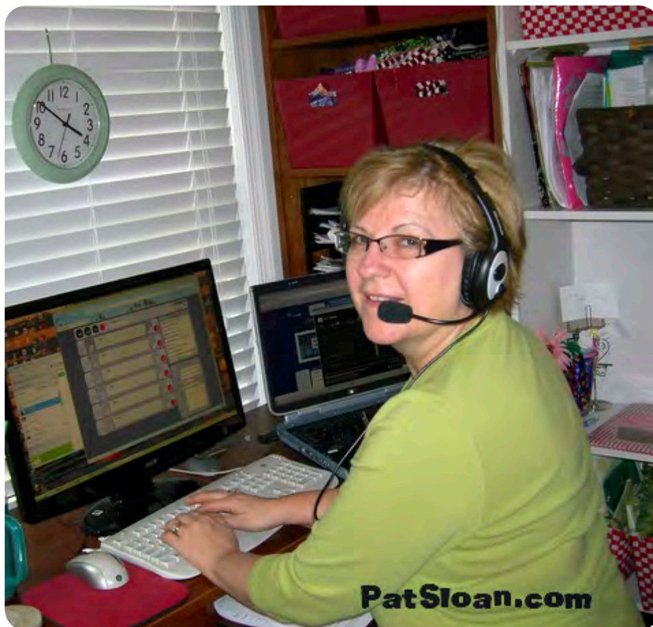
Live! The voice of quilting. American Patchwork & Quilting Radio

Well I did, and she is amazing. I was delighted to learn she is not the only quilting astronaut! But she took her quilting into space as her personal payload — so that is the sign of a true quilter. I interviewed her on January 6, 2014."