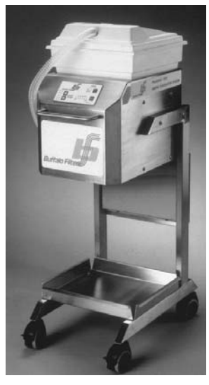
PlumeSafe 1202 With ViroSafe 12 Filter