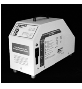
Porta PlumeSafe 603