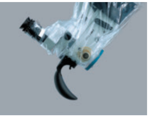
Unique and ergonomic: the sterilizable handle on top of the sterile drape