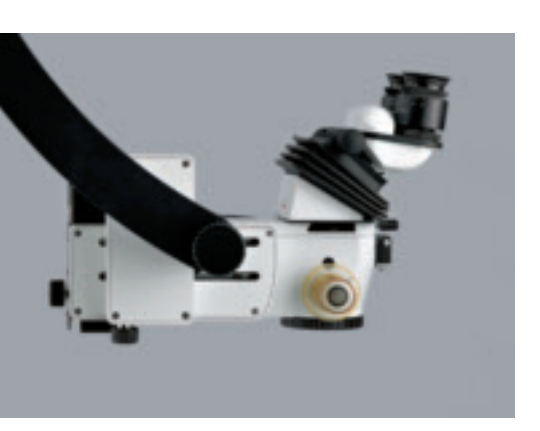
Fast and easy balancing with the ABC system