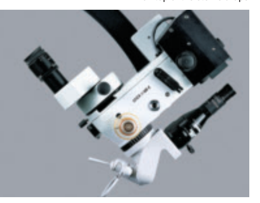
Various laser micro-manipulators can be mounted