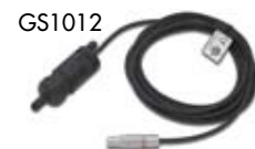
CO 2 Warmer