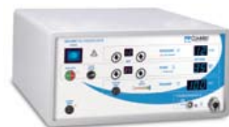
ConMed Linvatec 35L Insufflator Console