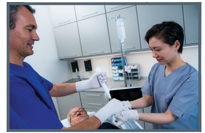
aScope 4 Cysto offers consistent quality every time