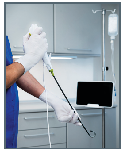
Bending angles of 210°/120° enable complete retroflexion.