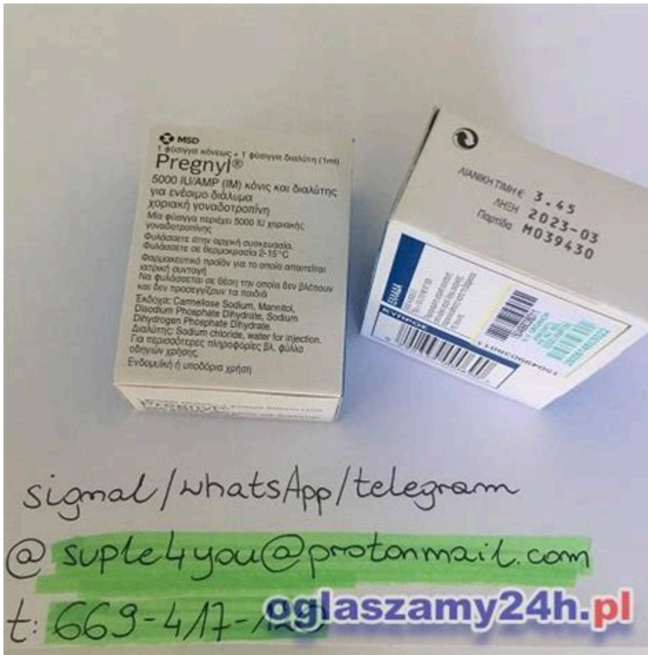
Pharmacom MIX-5 | Muscle

Rapid. Sold out. Pharmacom Boldenone 500 £ 60.00. Pharmacom Mix 3 500 £ 70.00. Availability: Out of stock. Email to a friend. £40.00. Join Waitlist. Add to Wishlist. Dear customers, please take notice that one of our oldest and biggest online stores www.PharmaComStore.ws is no longer offering Pharmacom Labs brand. After a mutual agreement it was decided that www.PharmaComStore.ws will extend its market and product range of other brands, except Pharmacom Labs. NEWS // 16.01.2018. 🔗