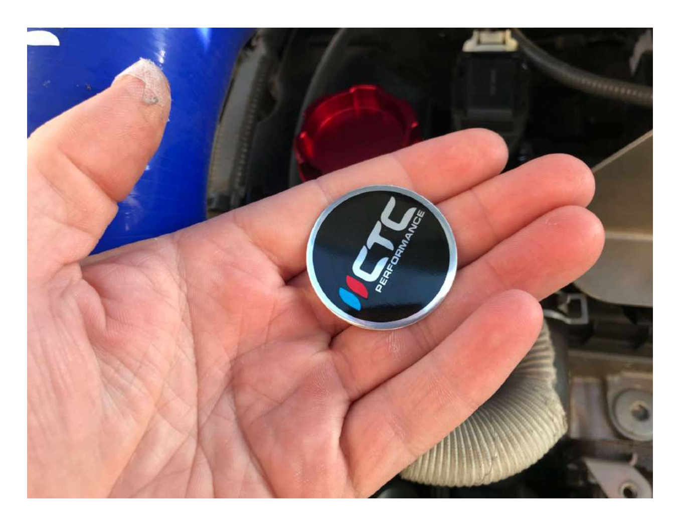
3. Turn over the logo plate, you will see double sided tape. Peel back the top layer leaving the adhesive on the oil cap.