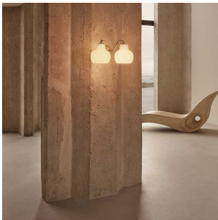
Set location - The Silo