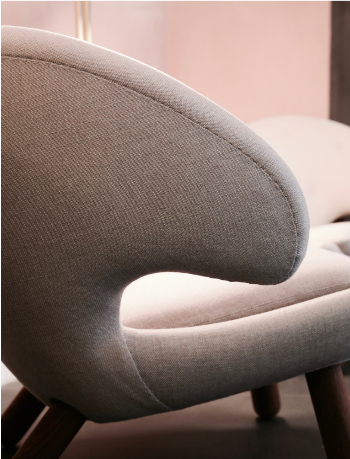
PELICAN CHAIR 1940 BY FINN JUHL