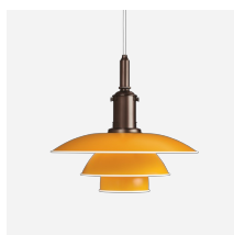
PH 3½-3 Pendant