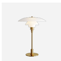
PH 3½-2½ Glass Table