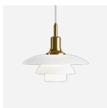
PH 3½-3 Glass Pendant