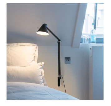
Set location -The Qvest

The fixture provides direct glare-free horizontal light while reflecting some of the light through the rear of the head, illuminating the top of the arm. The ergonomic design of the fixture head shapes the light and gives optimal light direction. A simple mechanical system provides great freedom of movement, so the light can always be set in the ideal position in the workspace. The shade is painted white on the inside, reflecting comfortable diffused light.