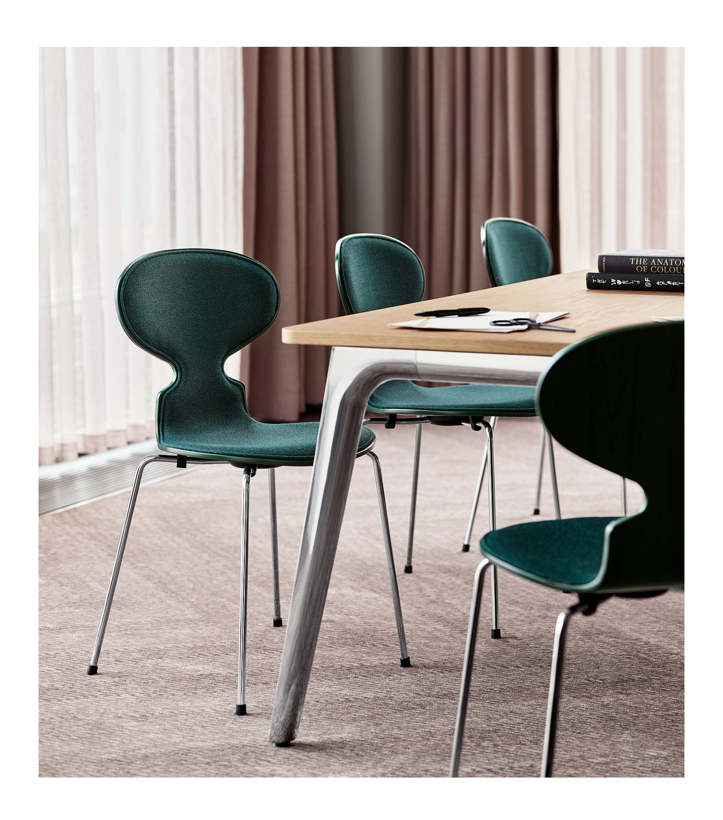
ANT™ PRODUCT FACT SHEET