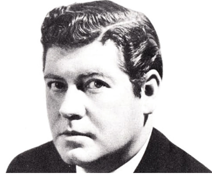
PAUL McCOBB (1917-1969)

Paul McCobb's innate understanding of perspective paved the way for a career as one of the most important design figures of his time. The self-taught designer's pragmatic yet perfectionist nature was reflected in his work, characterised by slender, graphic lines, a simplicity of form and lightness of design. His trademark scale and perspective imbued his no-nonsense designs, which focused on simplicity and functionality, pared-back to their purest forms.