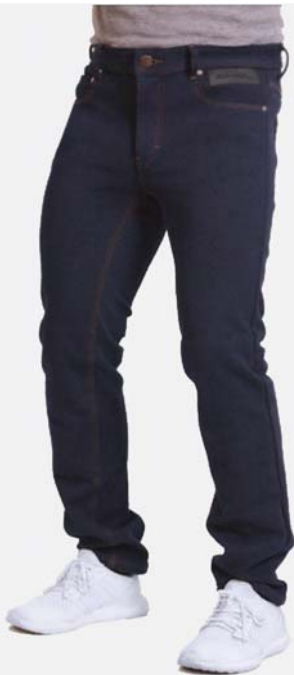
AXEL JEANS BLUE AJSBLU