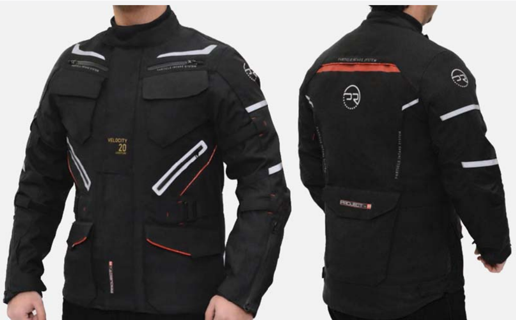
VELOCITY 20 ADVENTURE BLACK STEEL V20ABS