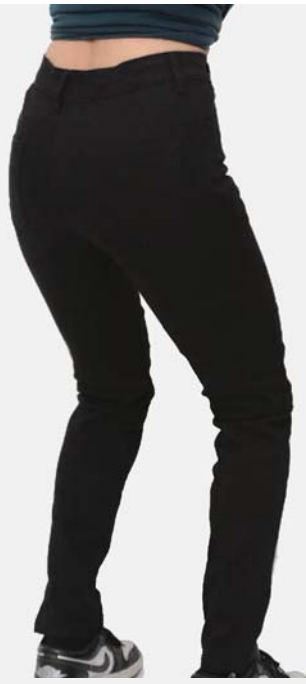
IVY JEGGINGS BLACK URBLK