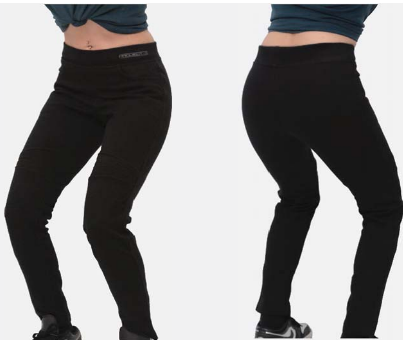
LILY LEGGINGS LLRBLK