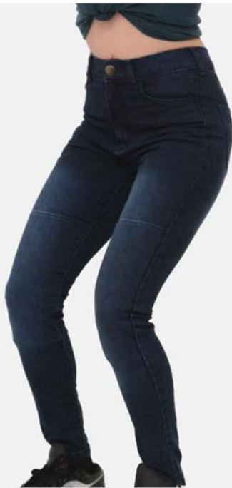
IVY JEGGINGS BLUE URBLU