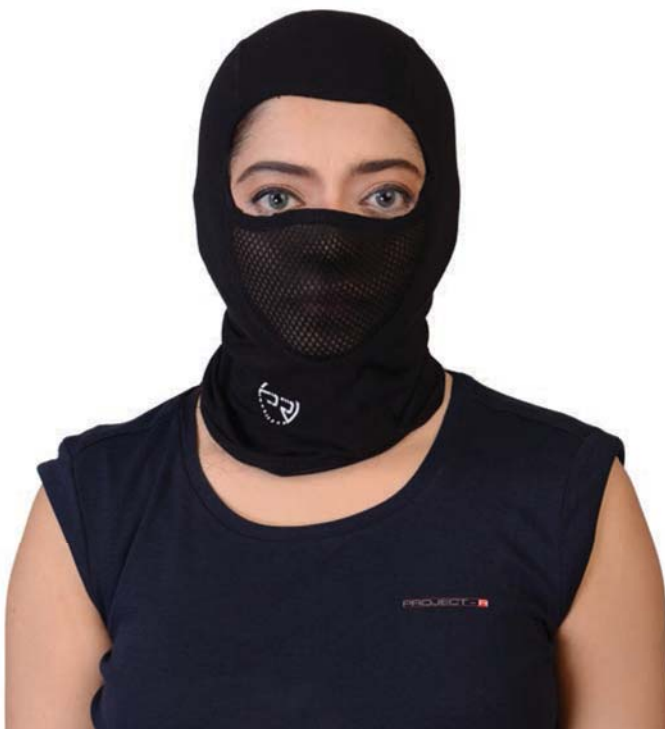
PRO BALACLAVA PLUS Black PBO2BLK