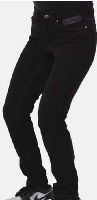
ELEANOR JEANS BLACK EJRBLK