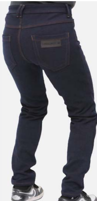
ELEANOR JEANS BLUE EJRBLU