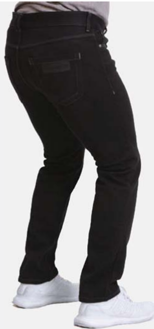
AXEL JEANS BLACK AJSBLK