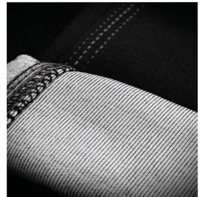
BARON HOODIE BLUE BHBLU