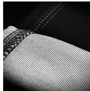
AXEL JACKET BLUE AJBLU