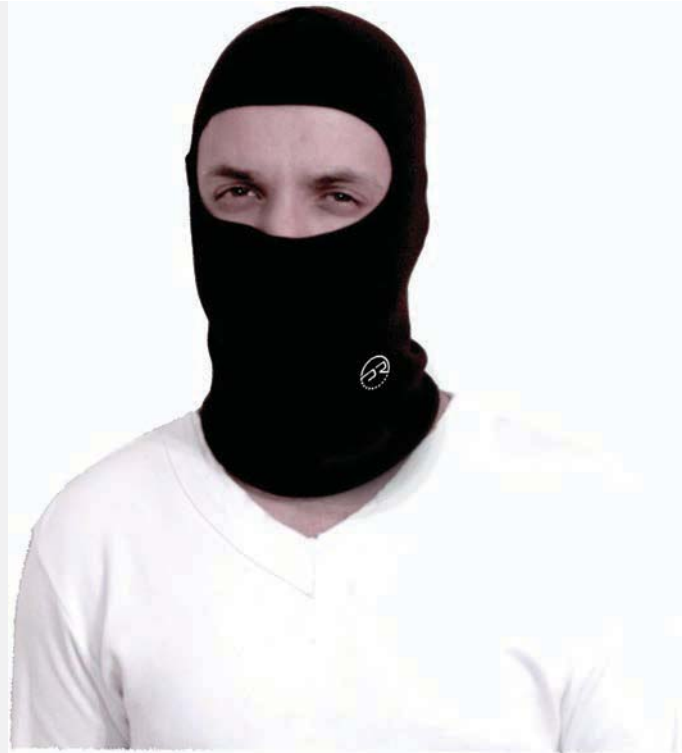
PRO BALACLAVA Black PBOIBLK