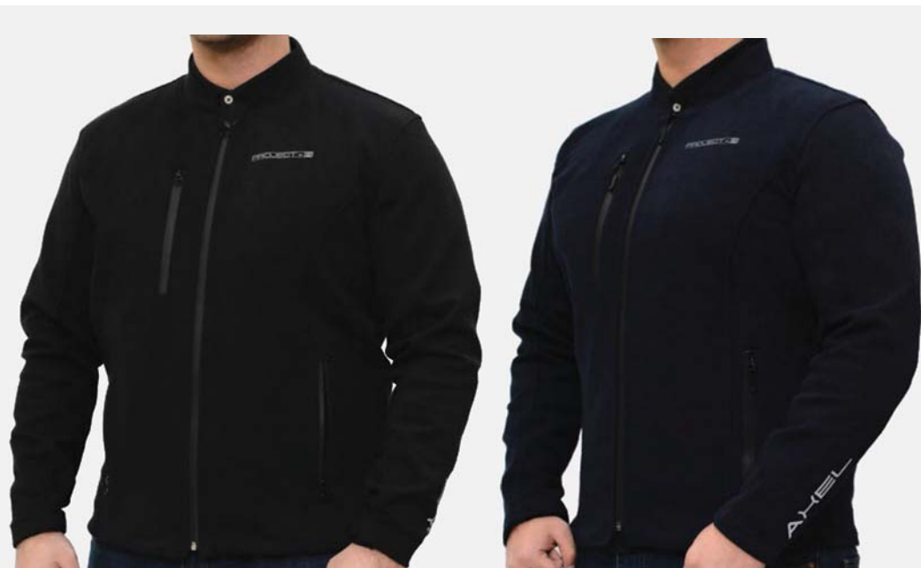
AXEL JACKET BLACK AJBLK