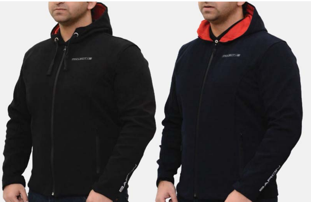
BARON HOODIE BLACK BHBLK