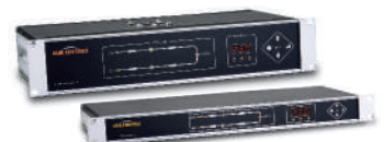
STATIC POWER SWITCHES