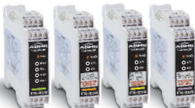
SIGNAL ISOLATORS & TRANSDUCERS